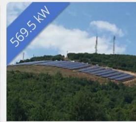
Energo-R Tenovo 2, 3, 4